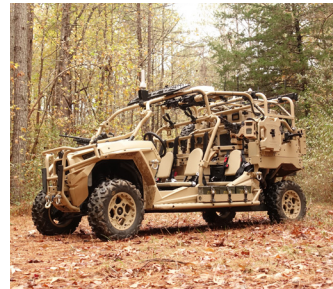
Tactical Cloud Package

Sherpa 6 currently performs integration, system validation, and testing for PEO Soldier at the Soldier Integration Facility (SIF). Through this effort we are supporting the design, procurement, and setup of the SIF. The SIF ensures new systems integrate with existing fielded systems and provides invaluable user feedback to the research and acquisition communities, providing confidence that what is being transitioned to the warfighter can help accomplish the mission.