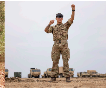
IVAS (Microsoft Hololens)