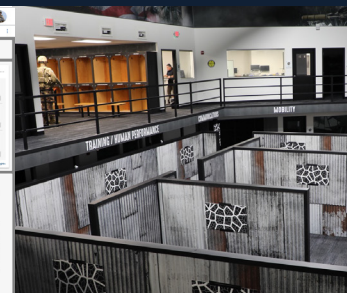
Soldier Integration Facility